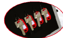
Internal Key Hooks DS2001 & DS2002 only