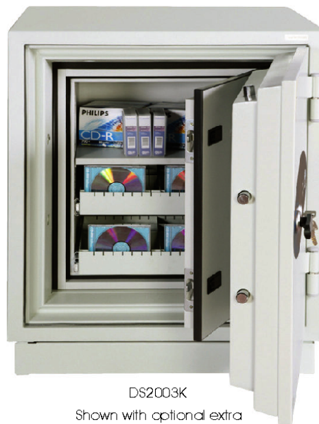
DS2003K Shown with optional extra multi media trays