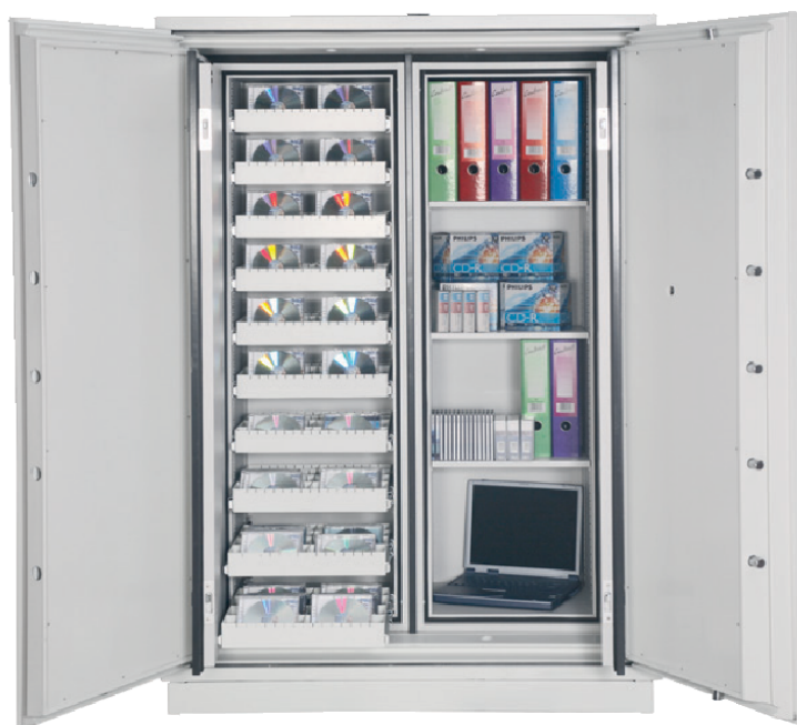
Data Commander DS4623E