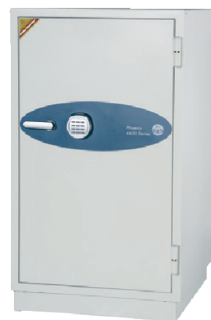
Data Commander DS4621E