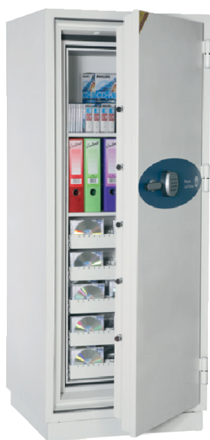
Data Commander DS4622E