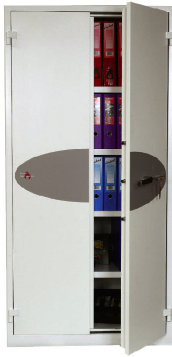
Fire Ranger FS1513K