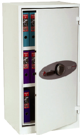
Fire Ranger FS1511E

Optional Extras Available Height adjustable shelves Suspended filing cradles Pull out lateral filing frame Telescopic shelves Cut Key (only available at time of order) Fingerprint Lock Data Protection Insert Changeable Keylock Secu B dual control/Time delay electronic lock