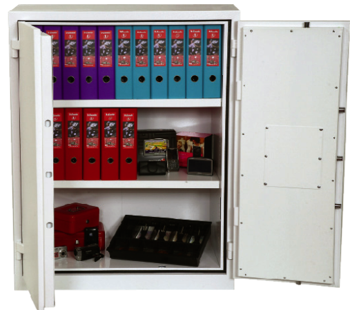
Fire Ranger FS1512K